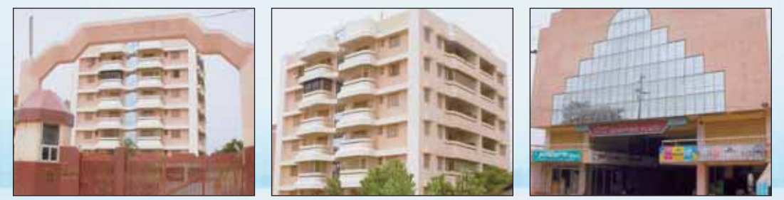
GT Heights (Front view)