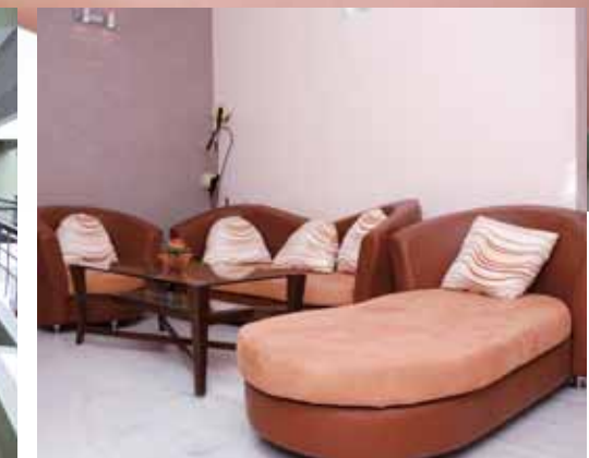
Actual site photographs