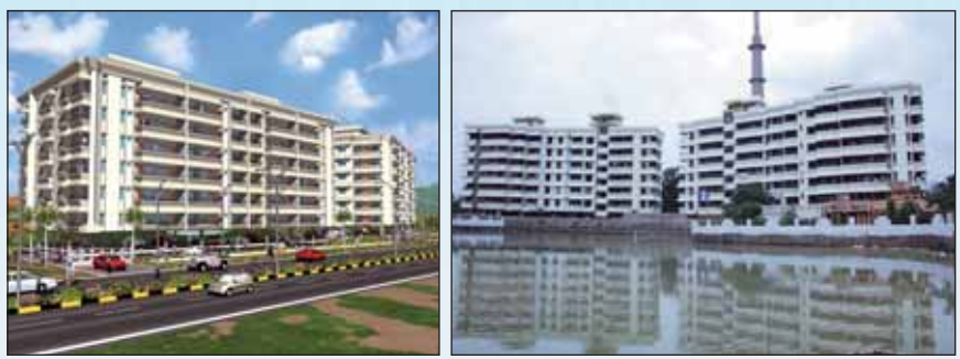
Exotica (Front view)

Leading, real estate promoter and developer since 1985. G.T. Homes is one of the largest names in Raipur. Have earned fame in less than two decades by promoting and developing MULTI STORIED APARTMENTS. G.T. homes are the pioneer of creating MULTI STORIED APARTMENTS in Raipur. Dedicated Managers, Executives and Commercial Officers constantly back the vertically integrated team of G.T. Homes, which is solely committed to maximising, customer satisfaction and enhancing value. The Directors, drive innovative ideas from their vast experience in the business. The groups' portfolio, boasts of numerous landmark projects, marked by their exemplary integrity and professionalism. Some of the projects are, Vasundhara Sadan, Daljeet Apartments, G.T. Shopping Plaza, G.T. Heights, Exotica and alikes. Also associated with remarkable land development projects, such as CAPITAL CITY PHASE I & II at Saddu. As ethical builders, G.T. Homes associate only with people, who have a credible track record and reputation. As a result, buyers need not fear or compromise on the quality of construction, when they buy property. The strong bond also ensures that, commitments made are invariably honoured. G.T. Homes caters to every pocket. The exceptional database and professional contacts, assure a choice of properties to fit any budget.